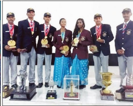
Medal-winning Cadets being received by the Training Team of 3 Kamataka Naval NCC Unit, Mysuru, on their arrival at Mysuru Railway Station on Oct.24.

Mysuru, Oct.26-A total of seven cadets from 3 Kamataka Naval NCC Unit located in Mysuru represented the Kamataka and Goa Directorate in the recently concluded All India Nau Sainik