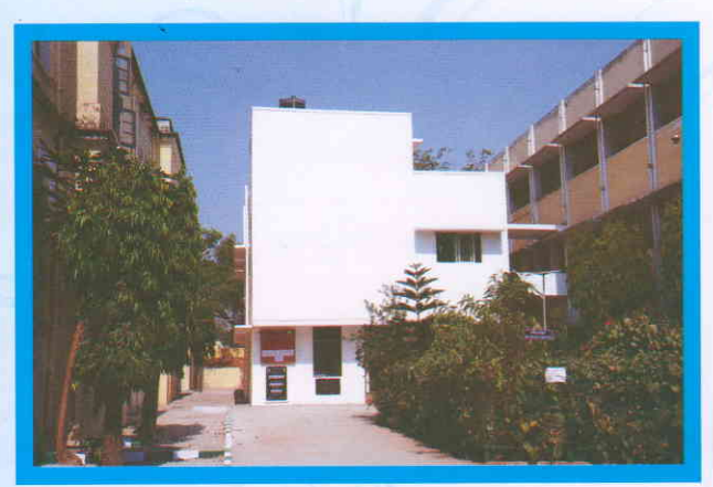
Electronics and Botany Development