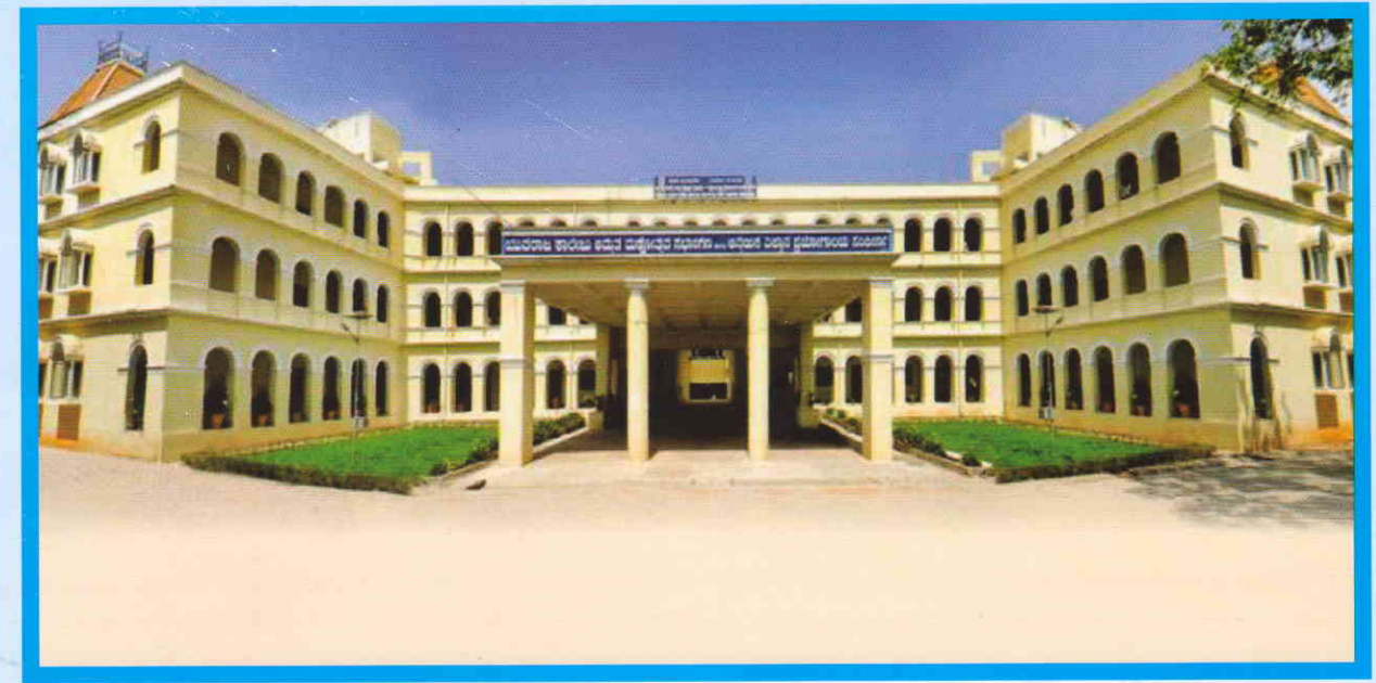
Platinum Jubilee Auditorium and Applied Science Laboratories Building